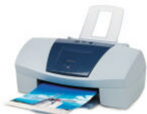
Photo Printing. Canon has released the new S520 photo printer which offers amazing photo quality for only $449.00. If you have a digital camera, this is the printer to buy, as it will produce borderless prints up to A4 in size.

The S520 has individual ink tanks, and therefore offers excellent value for money when it comes to running costs. Drop in and check out the sample photos we have printed.